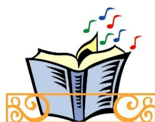
Hymns of Faith And Hope

Ladies, Sisters in Service (SIS) will host a salad luncheon at church on Saturday, September 23rd. They’re still in the planning stages, so mark your calendars and look for more details to come.